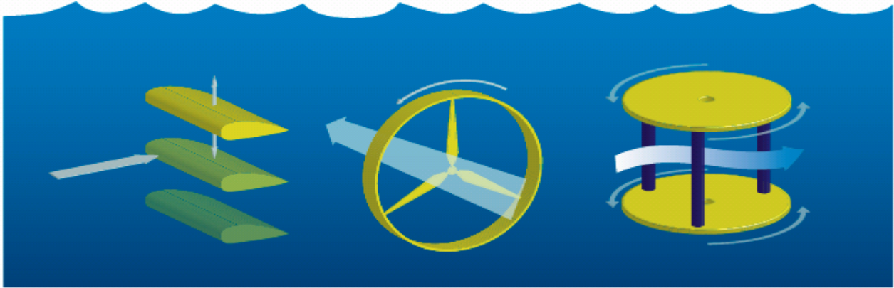
Figure 2: Three different varieties of tidal stream turbines 32

Tidal stream in comparison to tidal range is a relatively young technology which utilises the movement of the water from the naturally occurring tidal currents and generates electricity on both the ebb and flow tides. Tidal stream technology is not regarded as an established tidal power technology and as such was not considered in the original list of STP proposals. 31