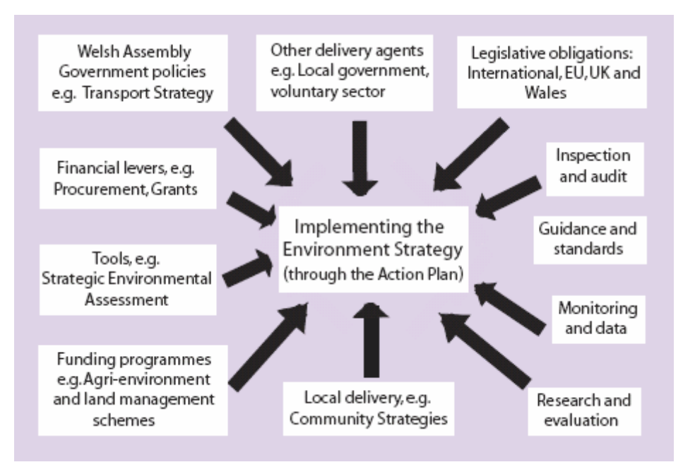
Figure 1 Interaction between the Environment Strategy Action Plan and other policy instruments

A complete listing of the outcomes, actions, and a table connecting them both with the corresponding environmental themes is available in the Annexes.